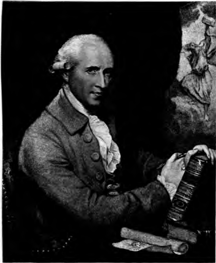
Benjamin West. Second President of the Royal Academy 1792-1805.